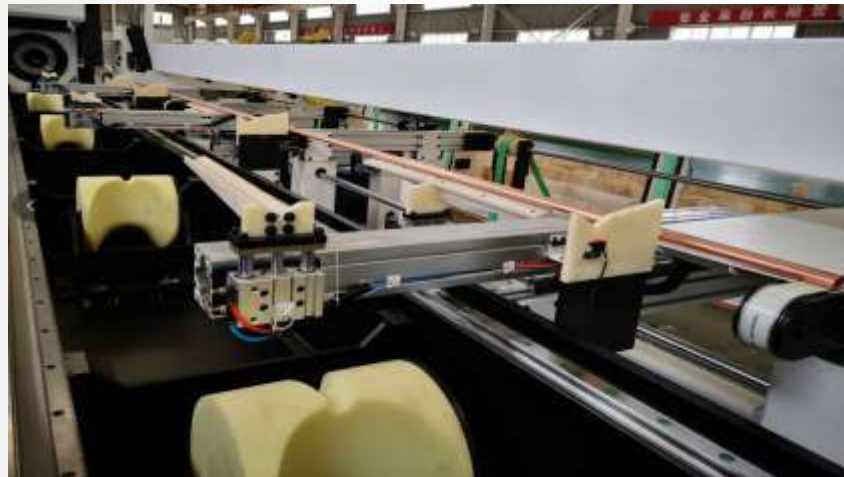
Universal chain feeding system LOAD PRO