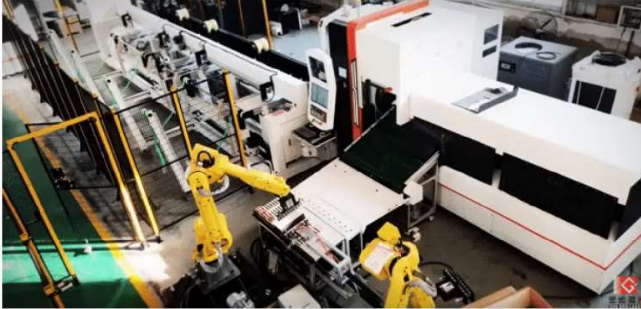
Europe client production line