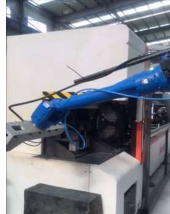
Europe client automation