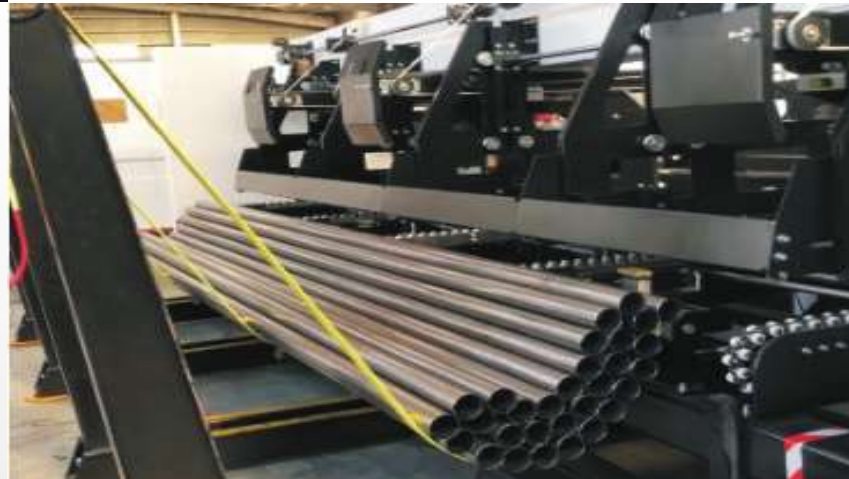
Special feeding system for round tubes